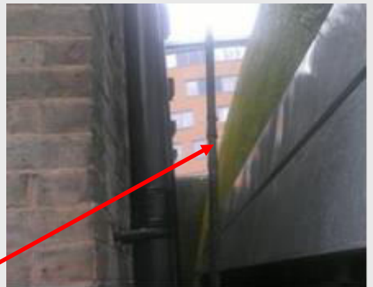
Wrap and bitumen coating